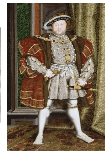
A portrait of King Henry VIII by Hans Holbein.

What do you want to know about rich and poor Tudor life?