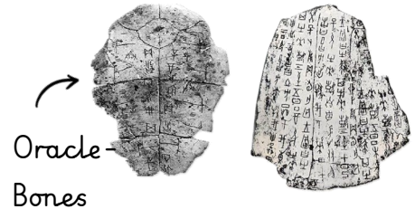
Area of Shang Culture

In 1976, archaeologists discovered the tomb of Fu Hao at the site of the ancient Shang capital, Yin Xu.